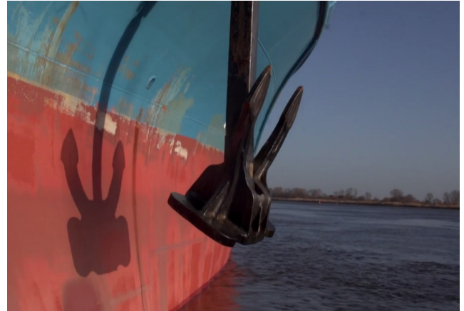
Photo – Vessel 's Anchor

Case#1: During a PaSea Real-Time Navigational audit, the cargo vessel was anchored for a bunkering operation in Singapore. When the operation was completed and the crew members commenced the heaving of the anchor, they realized that the anchor chain was heaved up with the anchor itself missing.