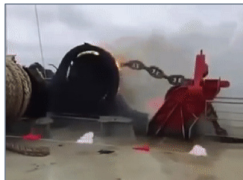
Photo – Ship chain - Anchor loss