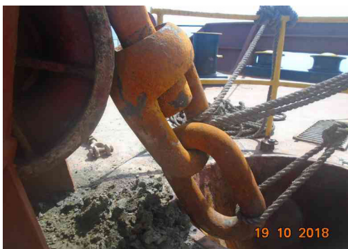
Photo – Port Anchor Chain