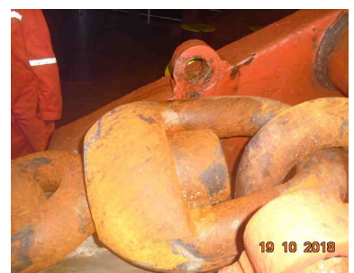
Photo – Swivel Pin

Due to crew involvement in anchoring operations, it is essential to perform frequent risk assessments focusing on personal safety.